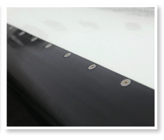
Pneumatic Wing Boots